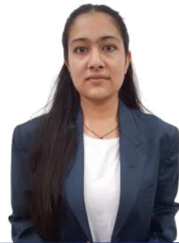
SAKSHI CULTURAL HEAD