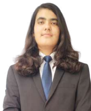
YASHASWI USG LOGISTICS